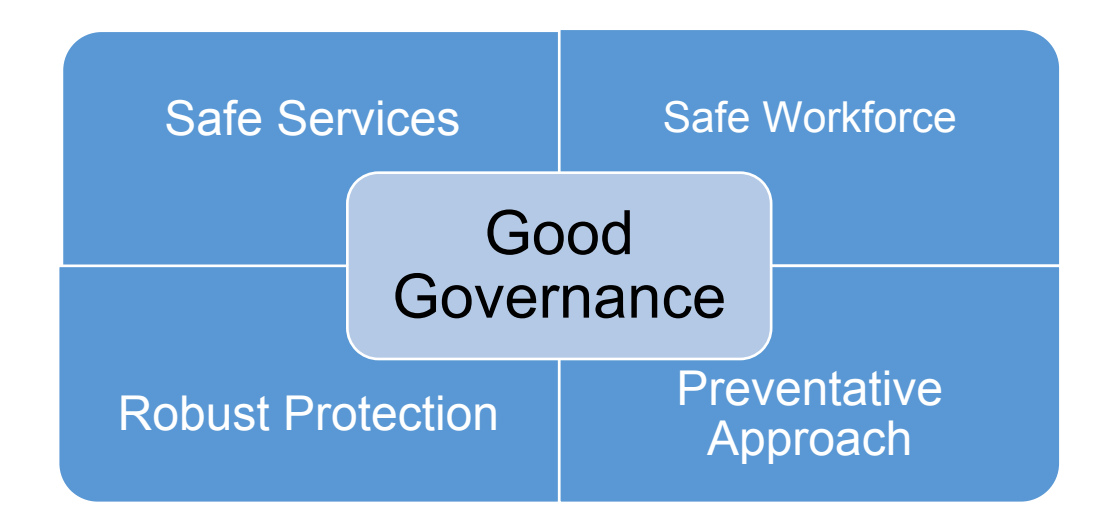
Table 1: The Cornerstones of safeguarding in Monmouthshire

concerning both groups. The 5 cornerstones of safeguarding within the Corporate Safeguarding Policy are set out below (Table 1).